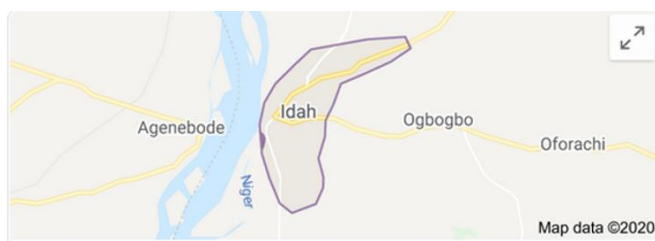
Figure 1. Map of Idah

Christianity and Islam are the predominant religions of the town. Christian missionaries have been active among the Igalas since the 1860s, and Idah’s Roman Catholic community sponsors both a secondary school and a teacher-training college and several other public and private secondary schools are found in Idah town. The Federal Polytechnic is also located in Idah, a Government Technical school, and a public hospital and many privately owned hospitals and clinics. Roads from the town lead to Nsukka and Anyigba, and there is ferry service to Agenebode across the Niger River [13].