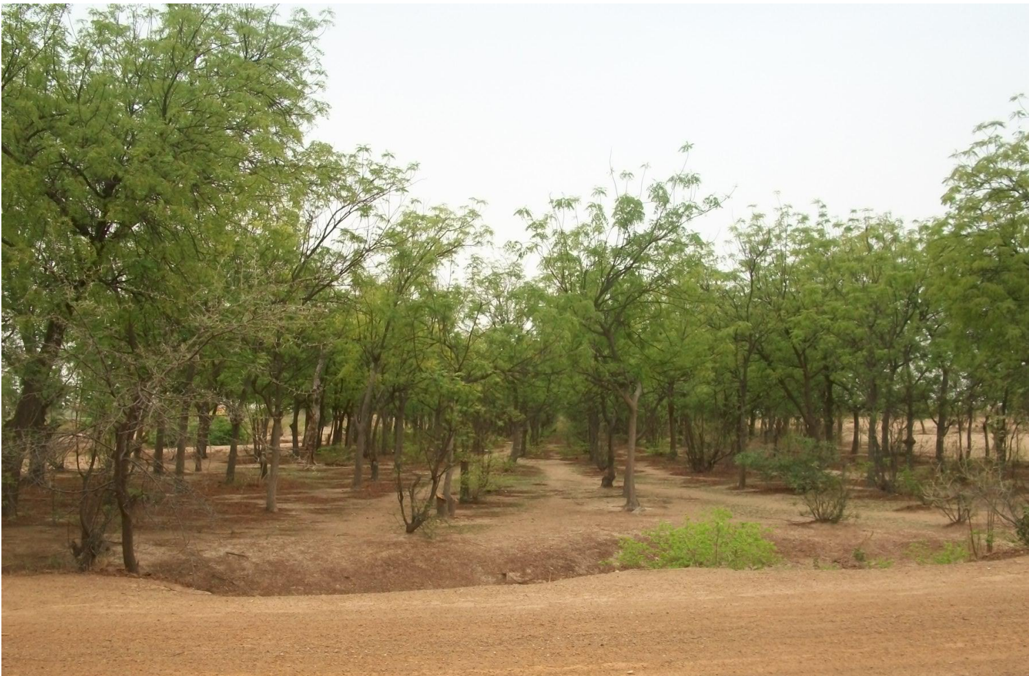
Plate 1: Azadirachata Indica plantation near Daddara village.

Before going to the field, the coordinates of the points were downloaded into the GPS unit and then the researchers used the GPS to collect the soil sample in the field.